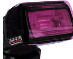
FILTER KITS $ 24.95