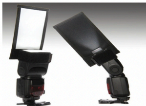
SPEED GOBO $ 17.95