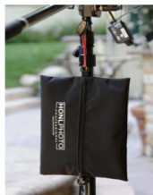
CARRYING BAG $ 24.95