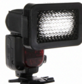
SPEED GRID $ 34.95