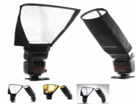
SPEED SNOOT/REFLECTOR $ 29.95