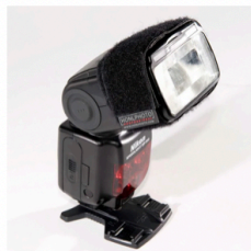
SPEED STRAP $ 14.95

A carefully made selection of professional flash equipment is available. Among other items, we are proud to be carrying the Honi Photo range of professional small-flash modifiers: