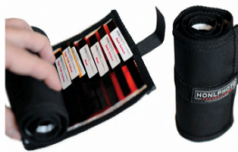
FILTER ROLLUPS $ 24.95