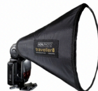
TRAVELLER8 SOFTBOX $ 79.95

We also sell ready Off-Camera Flash Kits: Starter Set (1 Flash), Work Set (2 Flashes) and Pro Set (4 Flashes). Details in-store or via email on request.